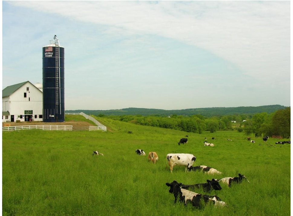
Bellvale Farms is situated in an ideal location for agritourism, just 50 miles north of Times Square, New York City.

Bellvale Farms is the New York State dairy farm closest to New York City. That proximity means that the number of farms in Orange County has declined steadily as the suburbs have grown; many of the Buckbees' neighbors commute to the city for work. In that environment, retailing farm products was an excellent option for growing the business without growing the 60-cow herd. The family started by growing and selling sweet corn, tomatoes, and pumpkins from a wagon on the farm. "We learned a lot from the vegetable business. It was a