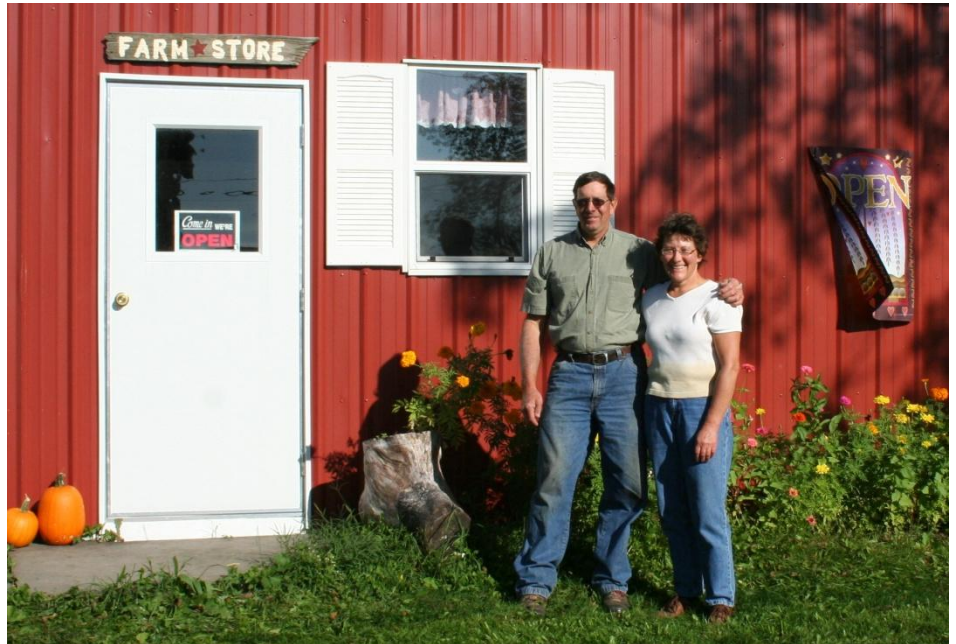
Selling raw milk, eggs and meat in an on-farm store has helped to diversify the Scheffler's income and create meaningful relationships with their neighbors.

The Schefflers like to do as much of the labor by themselves as possible, so they have made it a point to invest in equipment that will help them work efficiently and achieve high-quality products. For example, the stationary mixer installed in 2008 replaced a Rissler cart (a mobile mixer) and Ed is now producing a much more consistent ration for his cows. When it comes to